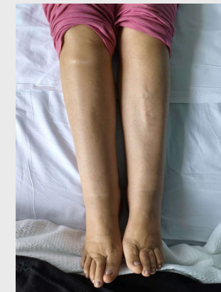
Figure 2. Photo of the patient demonstrating bilateral lower limb lymphedema.