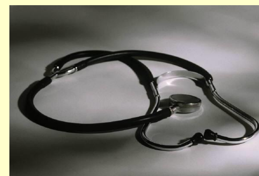
Figure 1. Label in 24pt Arial.