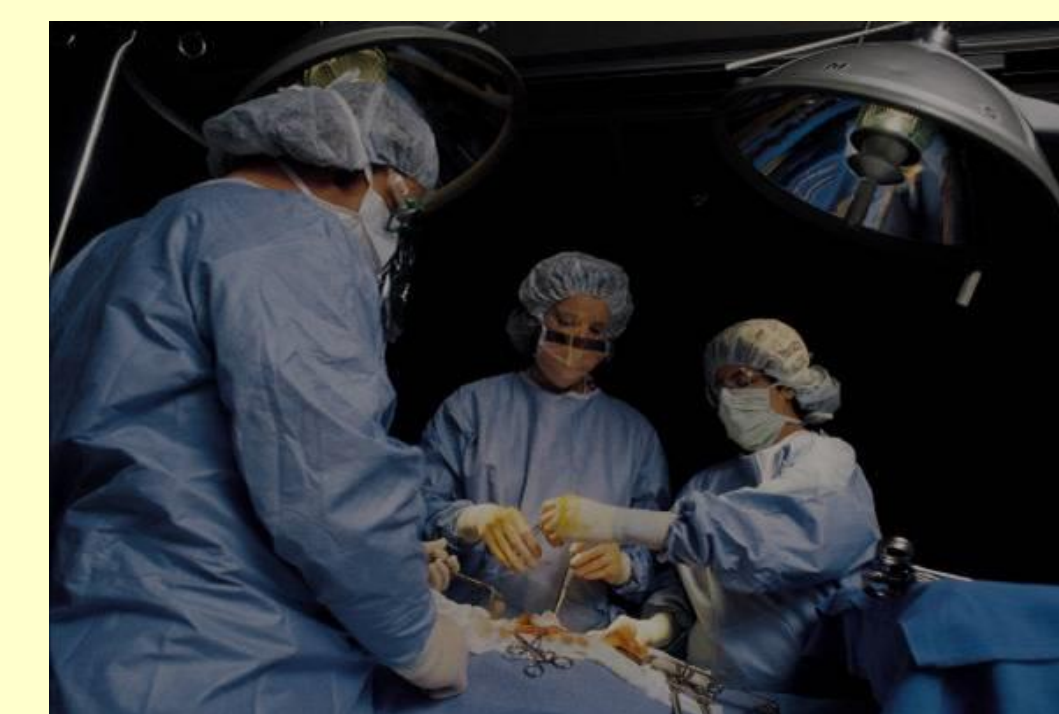
Figure 2. Label in 24pt Arial.