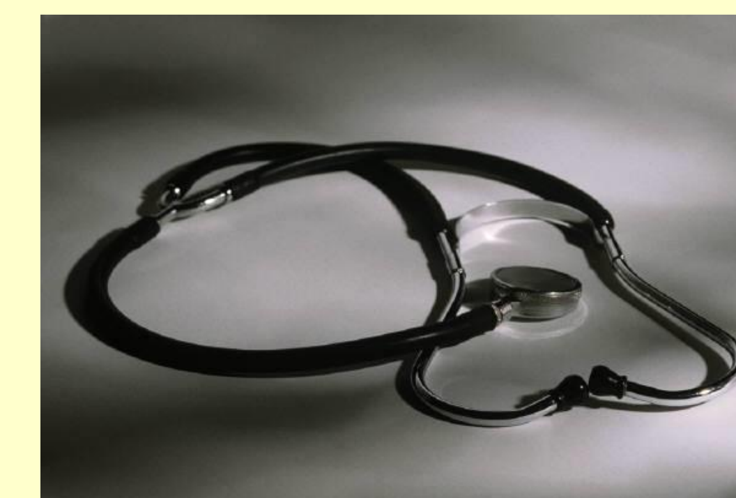
Figure 3. Label in 24pt Arial.