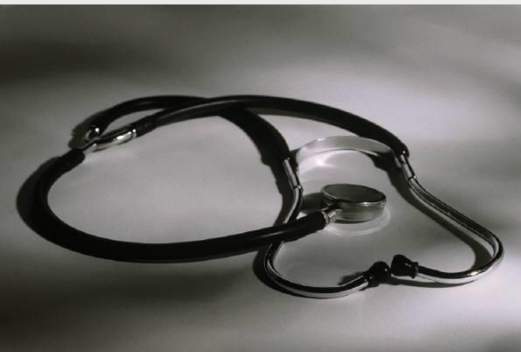
Figure 3. Label in 24pt Arial.