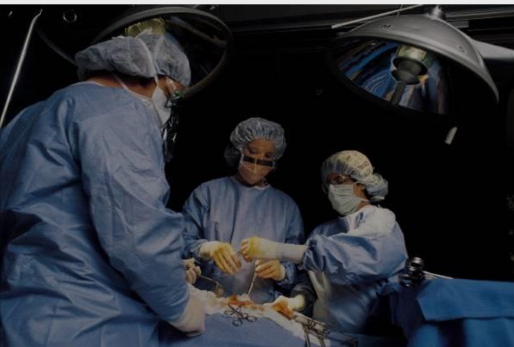
Figure 2. Label in 24pt Arial.