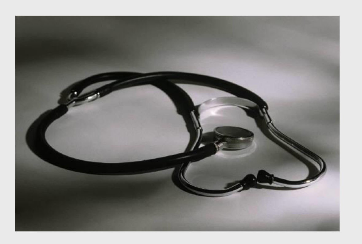
Figure 1. Label in 24pt Arial.

The various elements and text boxes included in this template are examples of what we commonly see on posters of this kind. They are simply placeholders and you should feel free to add, delete, rearrange, re-name, or re-size as best suits your needs.