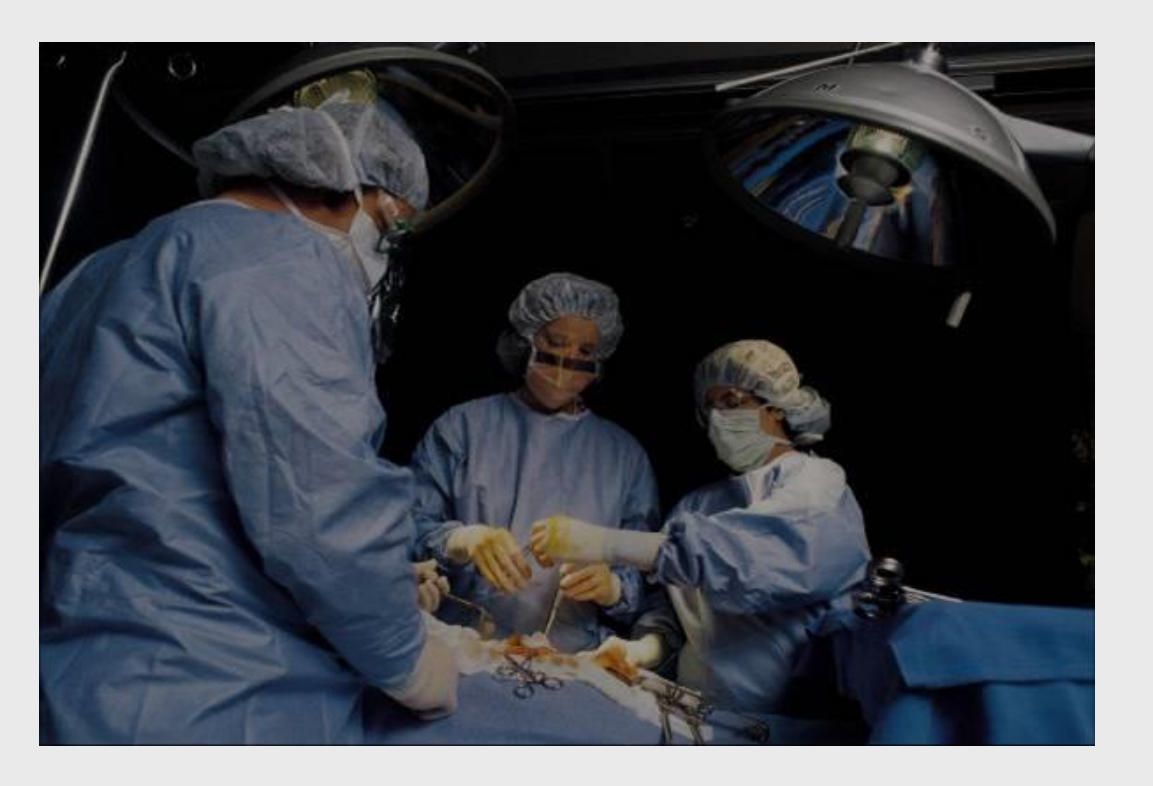
Figure 2. Label in 24pt Arial.

We print directly from PowerPoint so your poster will look just like it does on screen. Other printing outlets (Kinko's, for example) convert your file to another format prior to printing. This can result in elements shifting, loss of effects, or altered colors. By printing from the same version of PowerPoint that your file was created in, Genigraphics gives you the most accurate reproduction available.