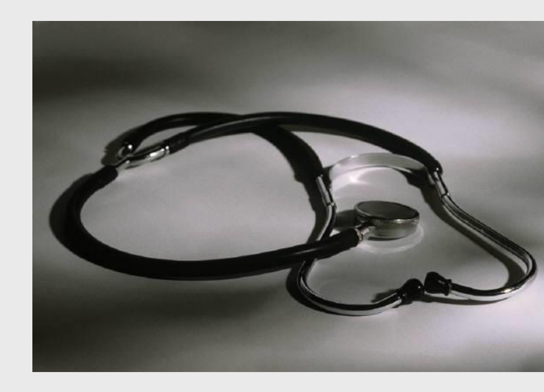
Figure 3. Label in 24pt Arial.